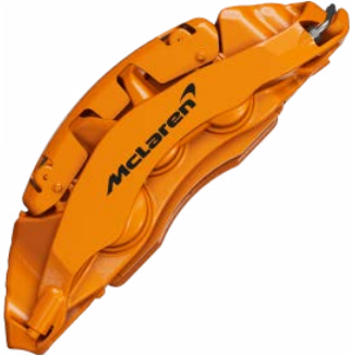
McLaren Orange with Black printed McLaren logo