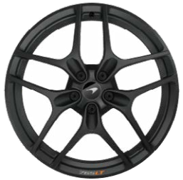
Stealth with laser-etched 765LT branding