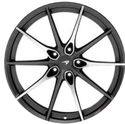
Satin Diamond Cut with laser-etched 765LT branding