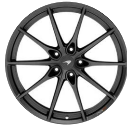
Stealth with laser-etched 765LT branding

Ultra-Lightweight 10-Spoke Forged Alloy Wheels