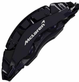
Black with Silver printed McLaren logo