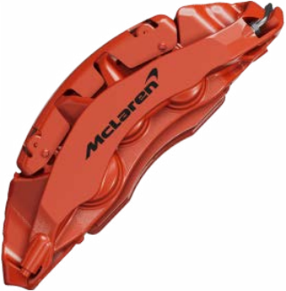
Nardo Orange with Black printed McLaren logo