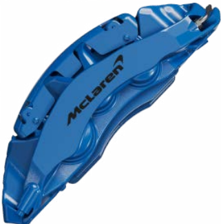
Azura Blue with Black printed McLaren logo