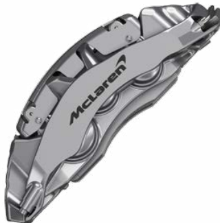
Liquid Silver with Black printed McLaren logo