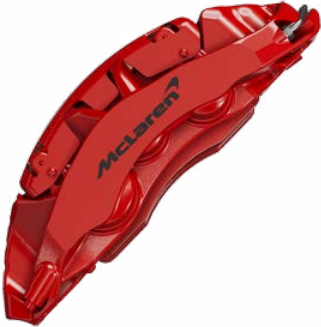
Red with Black printed McLaren logo