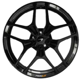
Gloss Black with laser-etched 765LT branding