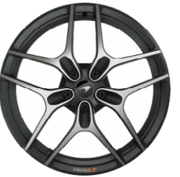
Satin Diamond Cut with laser-etched 765LT branding